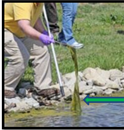
Photo 1 - Filamentous algae

Note: The stick test can fail when a particular type of blue-green algae is present. This type of algae is called Lyngbya wollei . This species of blue-green algae can form tough filamentous mats that float to the surface, similar to the mats formed by harmless filamentous green algae. However, Lyngbya wollei typically will have a very putrid sewage-like odor, which filamentous green algae do not. Lyngbya wollei mats also will often release a purple pigment in the water around them, which is something filamentous algae do not do. (See Photo 2.)