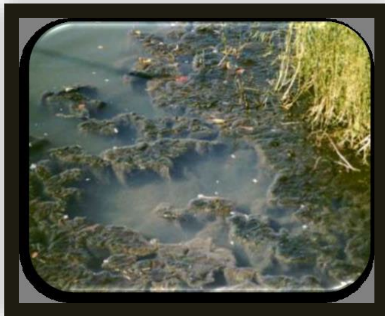
Photo 2 - Lyngbya wollei

Note: The stick test can fail when a particular type of blue-green algae is present. This type of algae is called Lyngbya wollei . This species of blue-green algae can form tough filamentous mats that float to the surface, similar to the mats formed by harmless filamentous green algae. However, Lyngbya wollei typically will have a very putrid sewage-like odor, which filamentous green algae do not. Lyngbya wollei mats also will often release a purple pigment in the water around them, which is something filamentous algae do not do. (See Photo 2.)